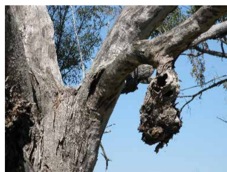
Great bird apartment in a standing dead tree