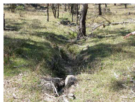
Gully head protected from erosion