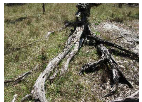
Good grass growth where timber slows run-off