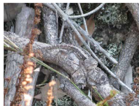
Perfect décor for a lizard!