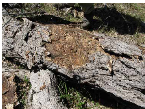
Rich bark decaying to recycle nutrients