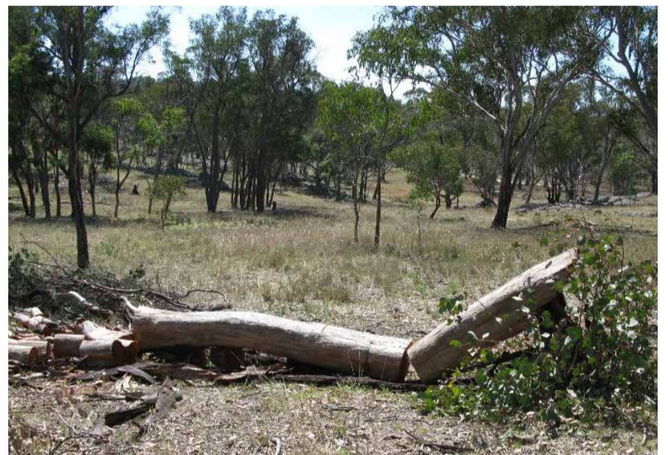
Tree fallen in a storm with regrowth at stump and healthy young saplings in the back ground.