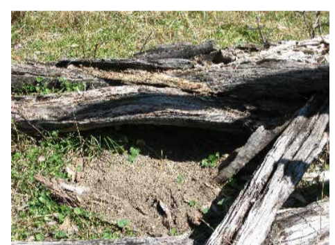
Snug echidna shelter